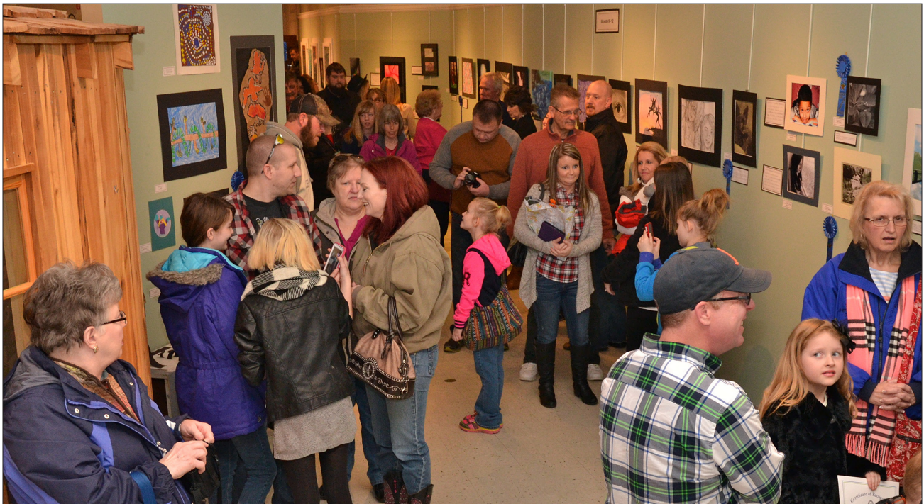
The annual 2015 Student Art Show drew a record crowd of more than 300 visitors to the Museum on March 1, 2015.