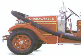
The 1928 Studebaker fire truck used in Greencastle for many years.