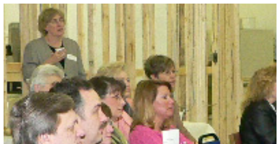
Greater Greencastle Chamber of Commerce Toast'n Tips at the Museum facility, March 28, 2006