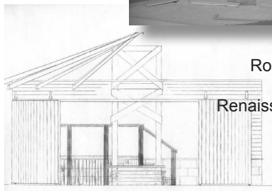
Round Barn Drawing By Bob Sorrels Renaissance Woodworks