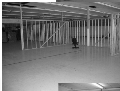
Storage & Office space