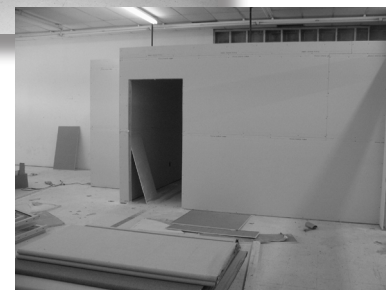
Oral History office

Members Only Sneak Preview May 12, 2006 7 - 9 p.m.