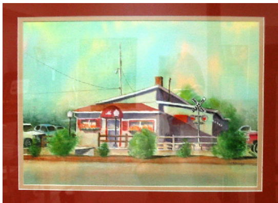
Water Color by Connie Kersey

If you are interested in participating or volunteering for arts programming or arts displays, please contact the Museum.