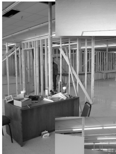
Future site of Round Barn