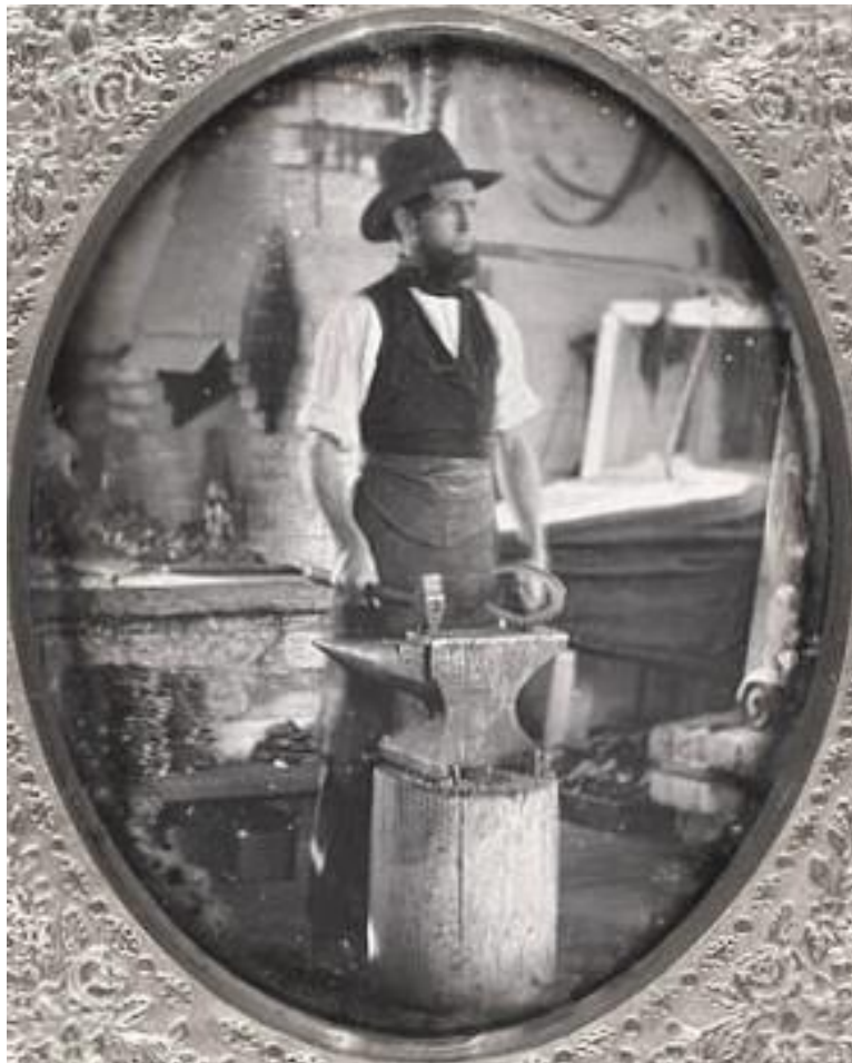
A blacksmith in his workshop, c. 1855

The essential tools for a smithy were a forge to heat metal; an anvil to set the hot and cold metal and working the metal into the desired shape or form; a bellows to keep the oxygen flowing to the forge and maintain the flame; hammers of various shapes to work the metal with repeated blows; tongs in various shapes to hold the metal tightly and to place it in the forge. In addition, vises, punches, grinding wheels, hoists, wedges, a water bucket for cooling, and wood for adding handles to items were common in the blacksmith shop of this time.